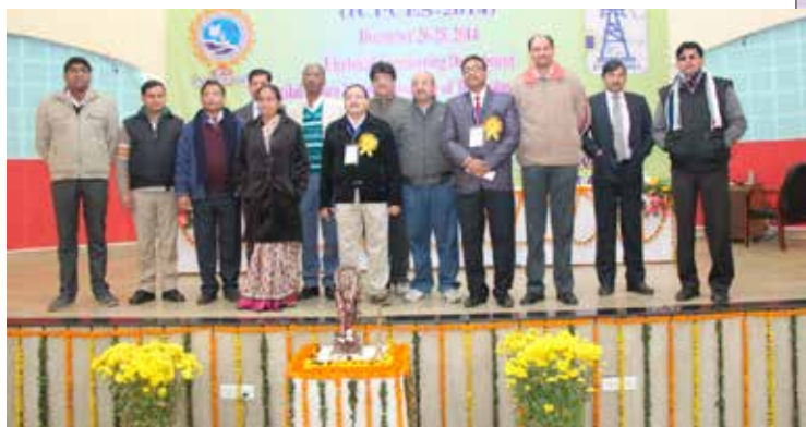
IEEE Executive Committee members