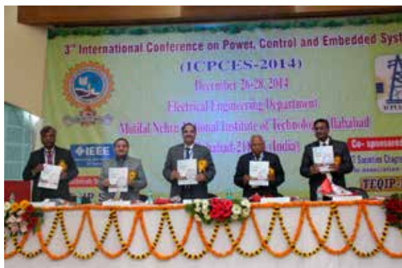
Unveiling of Conference Booklet and CD