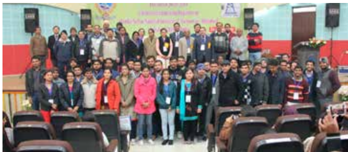
Conference Group Photographs