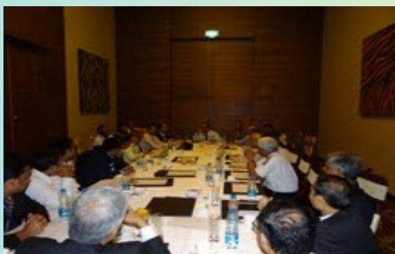
IEEE India Council Meeting at Kolkata