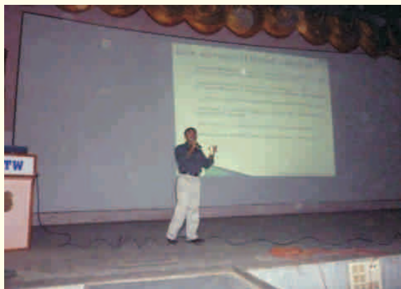
Elucidating basic concepts of Maltlab