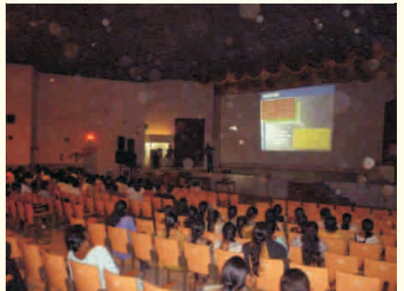
Understanding the Secrets of Images