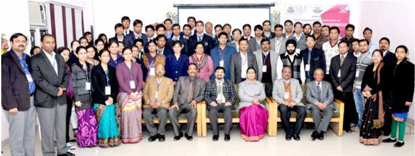
Group Photo in the Valedictory Session of the Conference